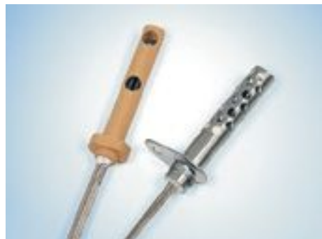
PuraFire igniters are available with ceramic or stainless steel casings.

PuraFire's fast-acting 24 volt electronic ignition energizes in just ten seconds. This eliminates unpredictable pilot light flames, as well as the inconvenience of having to clean pilots or restart them with a match. Plus, a tough porcelain casing protects the igniter from damage and excessive heat exposure.